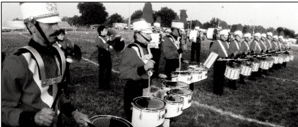
New York Skyliners Alumni, July 20, 2002.