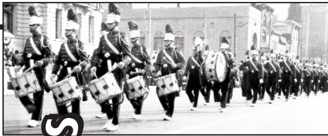
New York Skyliners, 1952.