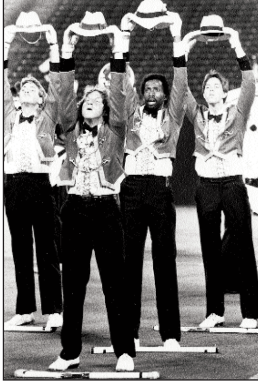
New York Skyliners, July 10, 1982, at the "Grand Prix" in the Meadowlands.

change in personnel, music and attitude. A lot of men called it a career and made way for a deluge of new Skyliners in their late teens whose junior corps were decimated by the draft, but whose "number" had not come up yet.