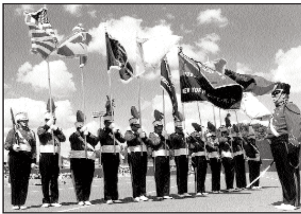
New York Skyliners, September 2, 1995, at the DCA Championships.

but inconsistency was the rule for nearly everyone. The finals in Rochester saw Hawthorne regain the title by a large margin over the Bucs, Sun and the Skyliners.