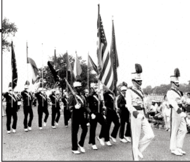
New York Skyliners, 1964 (photo by Moe Knox from the collection of Drum Corps World).

The Skyliners put on a terrific show, winning all captions except drumming. The Cabs won the contest by one-tenth of a point. In looking at the drum scores, the Cabs received a 19.9 out of a possible 20 from judge Vincent Mott of Paterson, NJ. The