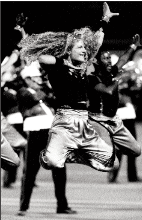
New York Skyliners, July 1993.

With 42 members in 1987, the horn line proved to be a force to be reckoned with. At Hershey, PA, the corps placed sixth and won high execution horns; in Waterbury, CT, the corps placed second and won the same category; at the "Barnum Festival," the corps placed fifth and took the caption again. At the "Grand Prix" in Bloomfield, NJ, the corps finished third and took home the high horn trophy.