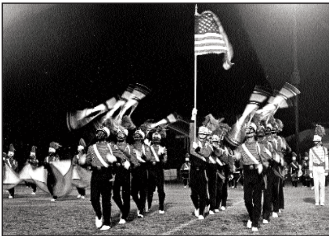
New York Skyliners, July 1976.