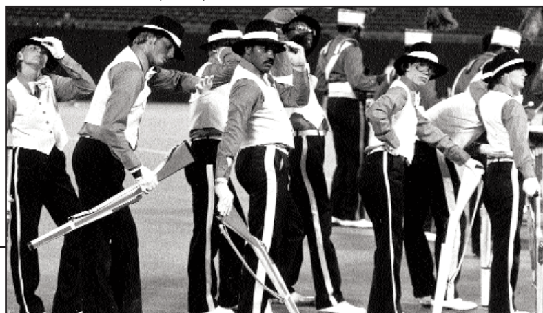
New York Skyliners, July 12, 1980, at the "Grand Prix," Meadowlands, NJ.