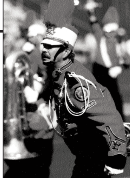
New York Skyliners, 2002.

As in 1999, the corps performed in class A competition for 2002, which they once again captured handily.