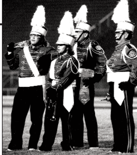
New York Skyliners, 1991.

Skyliners, retired. The rebuilding process started over again with many new faces joining the ranks. The corps needed time to grow as a unit and a victory was not in the offing that year. A fifth-place DCA finish in Rochester brought the curtain down on another season.